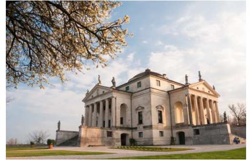
Villa Capra – La Rotonda

Palladio's masterpiece: since 1994 UNESCO World Heritage Site