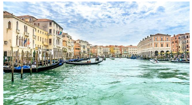
1 programme-day in Venice